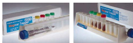
Fig. 2. Magnetic stand Magical Trapper (Code No.MGS-101)