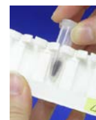
Fig. 3 Magnetic separation

Notes Suspend the magnetic beads completely prior to use.